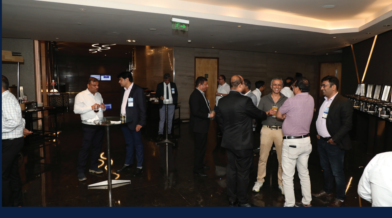
Networking over Cocktails & Dinner