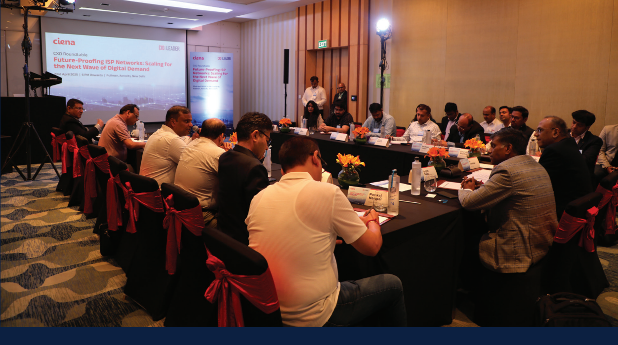
Roundtable discussion on "Future-Proofing ISP Networks"