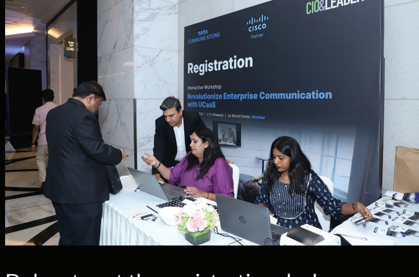
Delegates at the registration desk