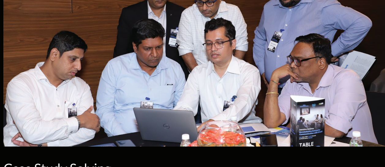
Case Study Solving