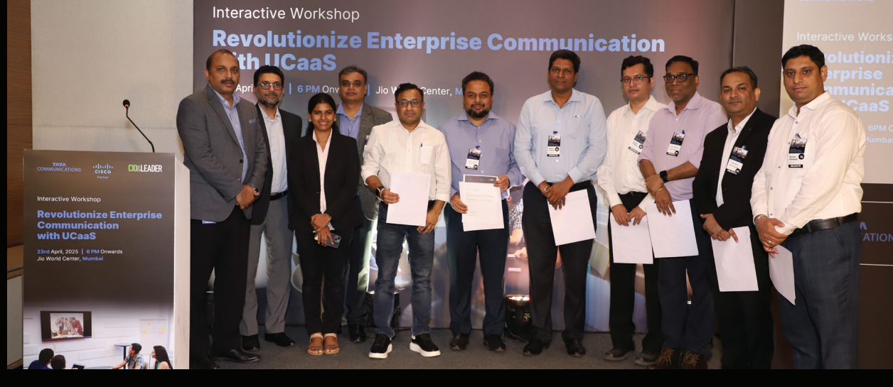
Case Study Winner Announcement