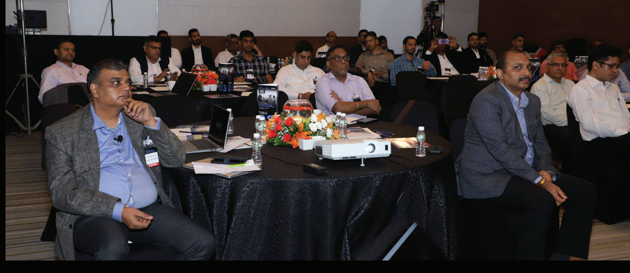
Delegates at the event