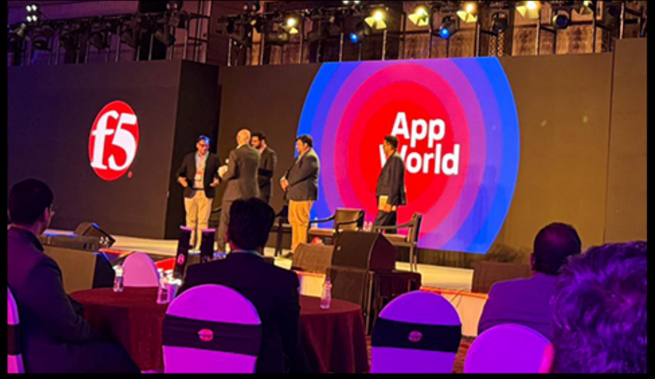
Panel Session with Experts