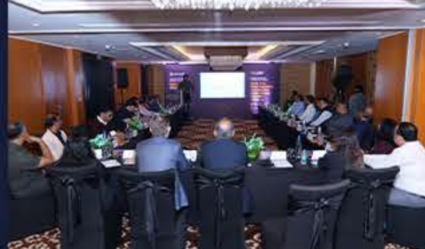
CXO Conversation on Securing and Governing Data in the AI Era