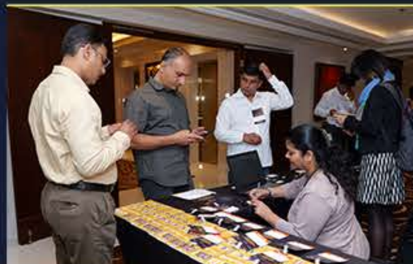
Registrations & Breakfast