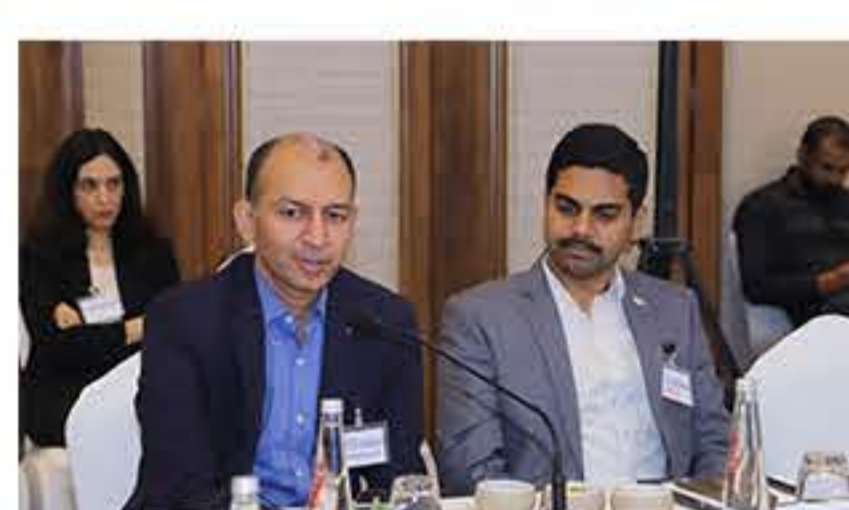
CXO Conversation on "Scaling AI Across Data, Applications & Infrastructure"