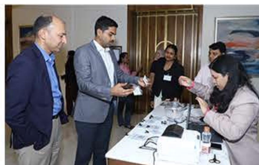
Delegates at the registration desk